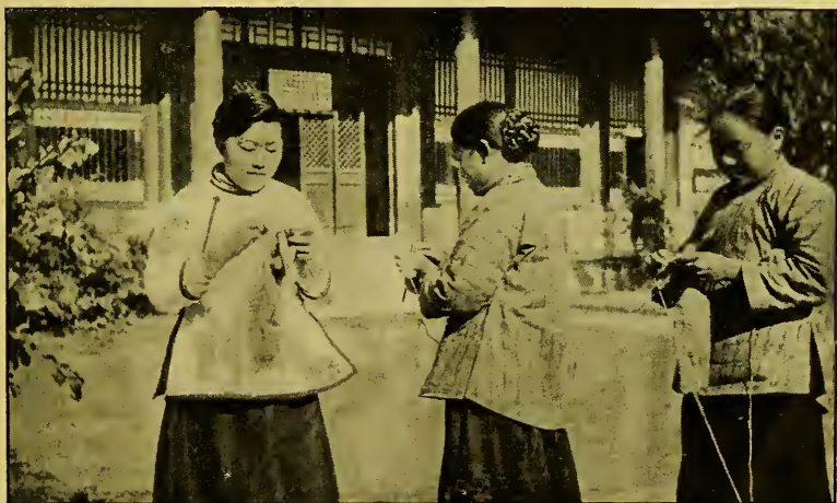
College Girls Knitting for Famine Sufferers.

Don't believe the reports that there is no longer any footbinding in China. The decree against it is obeyed only in the big